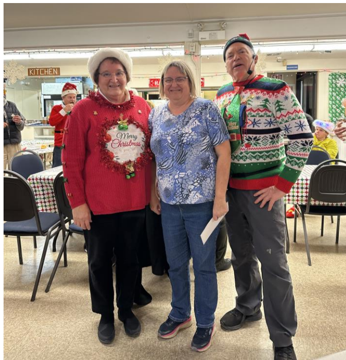
Ultra Horseshoes Tournament Winners B Division