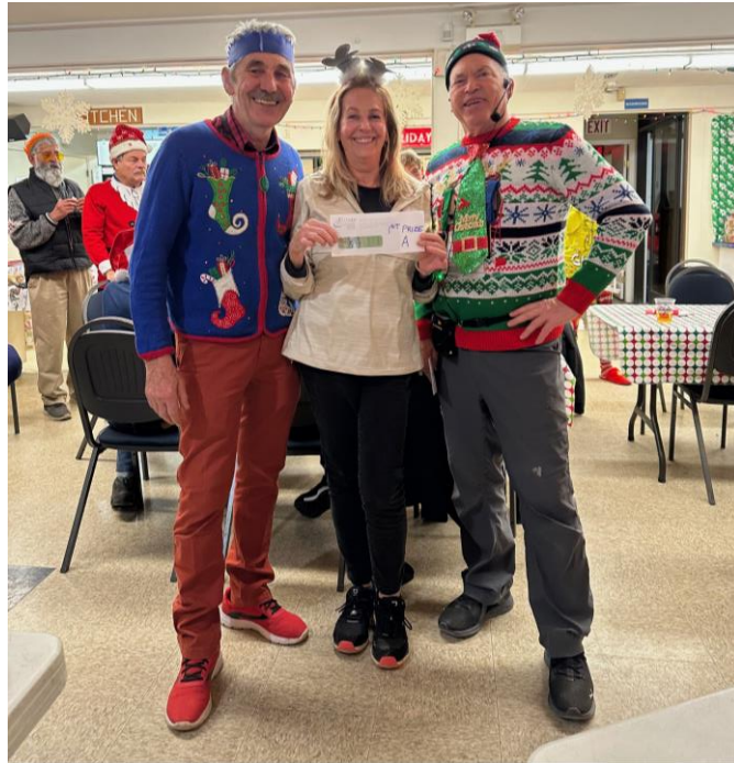
Ultra Horseshoes Tournament Winners A Division