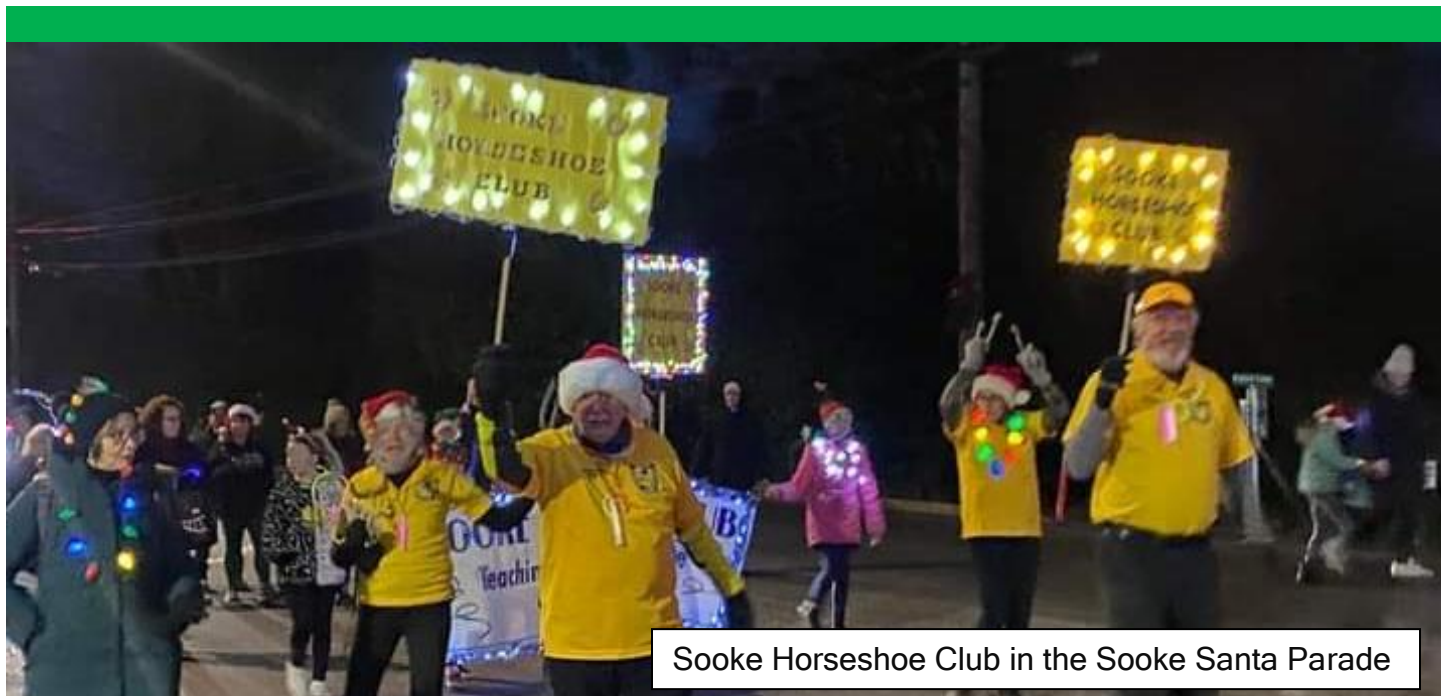
Sooke Horseshoe Club in the Sooke Santa Parade