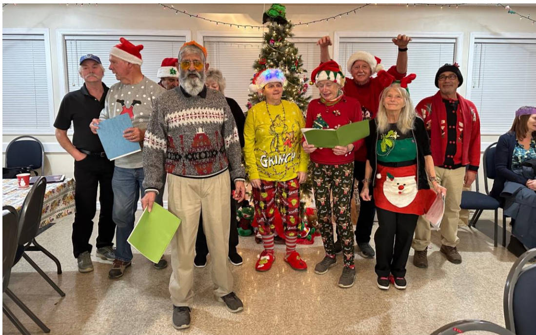
Our impromptu choir