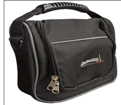
White distributors Holds 2 pair of shoes