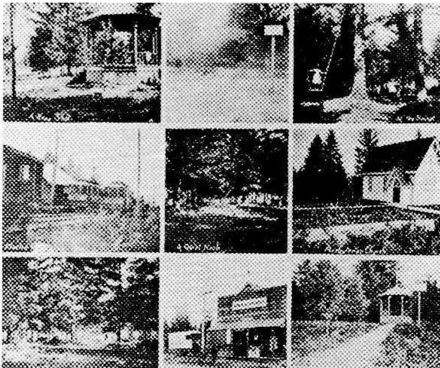
This composite photograph, taken in 1900, shows early views of Central Park, the first tram station, Presbyterian Church, and grocery store—all located on Kingsway.

By the 1880s, the City Council of both New Westminster and Vancouver eyed the reserve as a potential recreation ground. As construction of a tram line was underway, the Provincial Government moved to designate the whole reserve as a park. On January 14, 1891, the Lieutenant Governor of British Columbia, David C. Lam, proclaimed it as a public recreation ground for the enjoyment of the citizens of Vancouver and New Westminster. Vancouver Mayor Oppenheimer praised the new "central park" located midway on the tram line and when a tram station was established there, it bore the mayor's name. Unfortunately, the park was later cut in half to provide land for settlers east of Patterson Avenue and now forms the urban core of Metrotown.