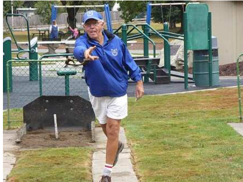
2016 PROVINCIAL CLASS CHAMPIONS